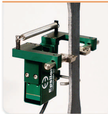
Model 3575 extensometer

simultaneously with the Model 3542 axial extensometer.