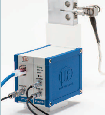
Model 4641 COD gage with signal conditioner