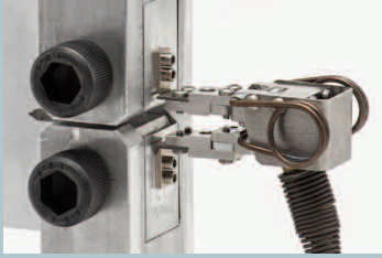
Model 4641 COD gage