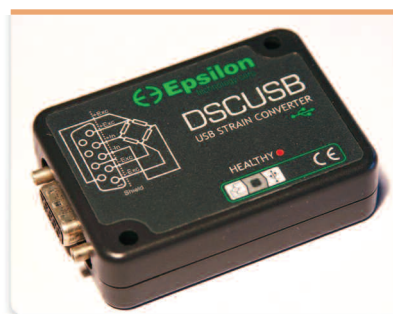
Model DSCUSB Digital Extensometer Interface

The DSCUSB provides USB plug-and-play capability to any strain gauged extensometer. They are useful when you wish to acquire data directly to your computer without the need for a controller.