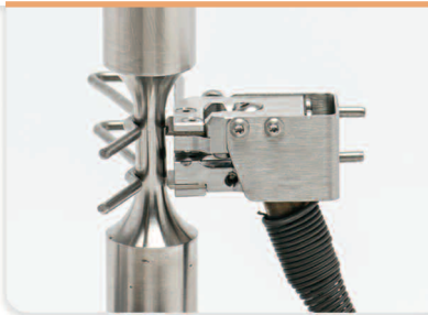
Model 7642-010M-025M extensometer

For use in environmental chambers where the entire extensometer must be exposed to elevated temperatures. These capacitive extensometers may be used up to 600 °C (1100 °F) without any cooling.