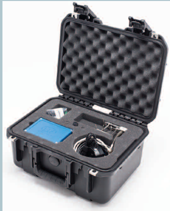
Models 7642 and 7675 extensometers