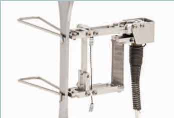
Model 7642-050M-125M extensometer

The 7642 is readily interfaced with most existing test controllers, and may be directly connected to a data acquisition system or chart recorder, or directly to a PC. The 7642 may be used for strain controlled tests such as low cycle fatigue.