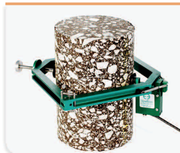
Model 3975 extensometer

Designed for accurate measurement of small diametral strains such as those required to determine Poisson's ratio of rock, concrete and asphalt samples. The units are designed to be used in conjunction with the Model 3542RA axial averaging extensometer.