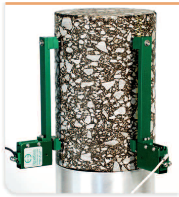
Model 3909-0400 with 4 inch gauge length

Designed for measuring axial displacements in the simple performance tests prescribed by NCHRP Report 465, and determining dynamic modulus of hot mix asphalt per AASHTO TP062.