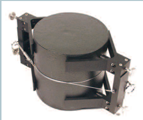
Model 3909 gluing fixture for 180° spacing