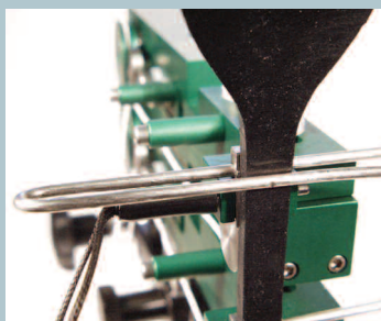
Specimen attachment with Model 3800

Please let us know at the time of order what type of output and connector you require.