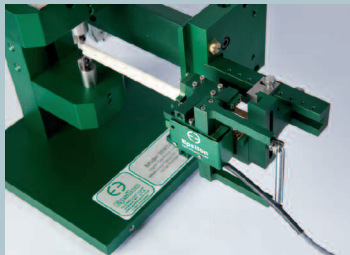
Model 3548COD with no heat shields mounted to a Model 3590VHR calibrator