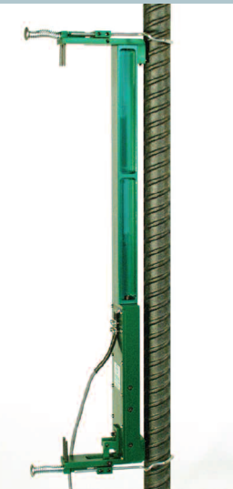
Model 3543 with 12 inch gauge length