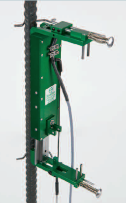
Model 3543 with 4 inch gauge length