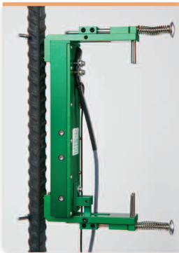
Model 3543-0400-200T-ST with 4 inch gauge length and +2 inch measuring range

This model is available in gauge lengths from 2 inches (50 mm) and larger, with measuring ranges up to 4 inches (100 mm). It is a uniquely designed unit that may be left on through specimen failure. These extensometers are widely used where long samples and large measuring ranges are required. They are ideal for testing steel re-bar, weld joints, and wire materials.