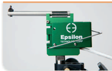
Model 3540 with 0.05 inch measuring range

Widely used for measuring deformations in three and four point bend tests, compression tests and a variety of general purpose deformations. These strain gaged devices come with a magnetic base for easy mounting.