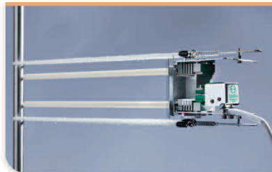
Model 3448 with 25 mm gauge length and 20% measuring range

Designed for use with furnaces and induction heating systems, these extensometers use Epsilon's exclusive, self-supporting design. A wide range of options cover most testing applications.